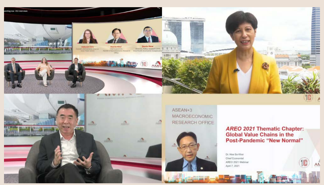
AMRO holds a webinar to discuss global value chains in the "new normal" on April 7, 2021.

These efforts have helped AMRO stay abreast of daily movements in the constantly changing financial markets, examine the challenges and opportunities facing the sector, and provided invaluable input to AMRO's surveillance work.