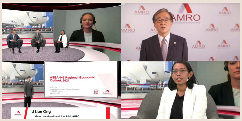
The 2021 ASEAN+3 Regional Economic Outlook launch is livestreamed on March