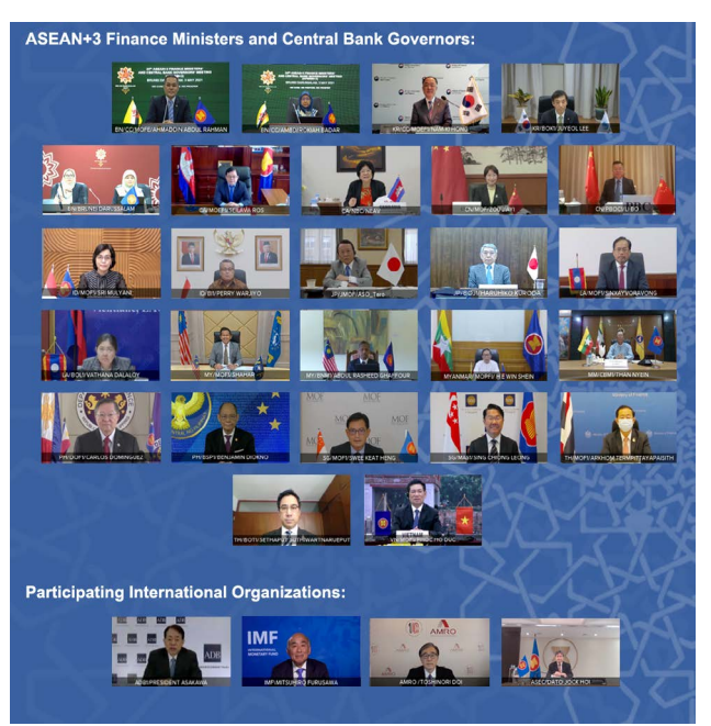
AMRO attends the virtual 24th ASEAN+3 Finance Ministers' and Central Bank Governors' meeting on May 3, 2021.

In Q2 2021, Senior Management approved AMRO's Corporate Crisis Communications Plan. In Q3 2021, AMRO organized media training for 29 employees, including Senior Management, Group Heads, and Economists, to enhance their knowledge on how best to convey the organization's messages.