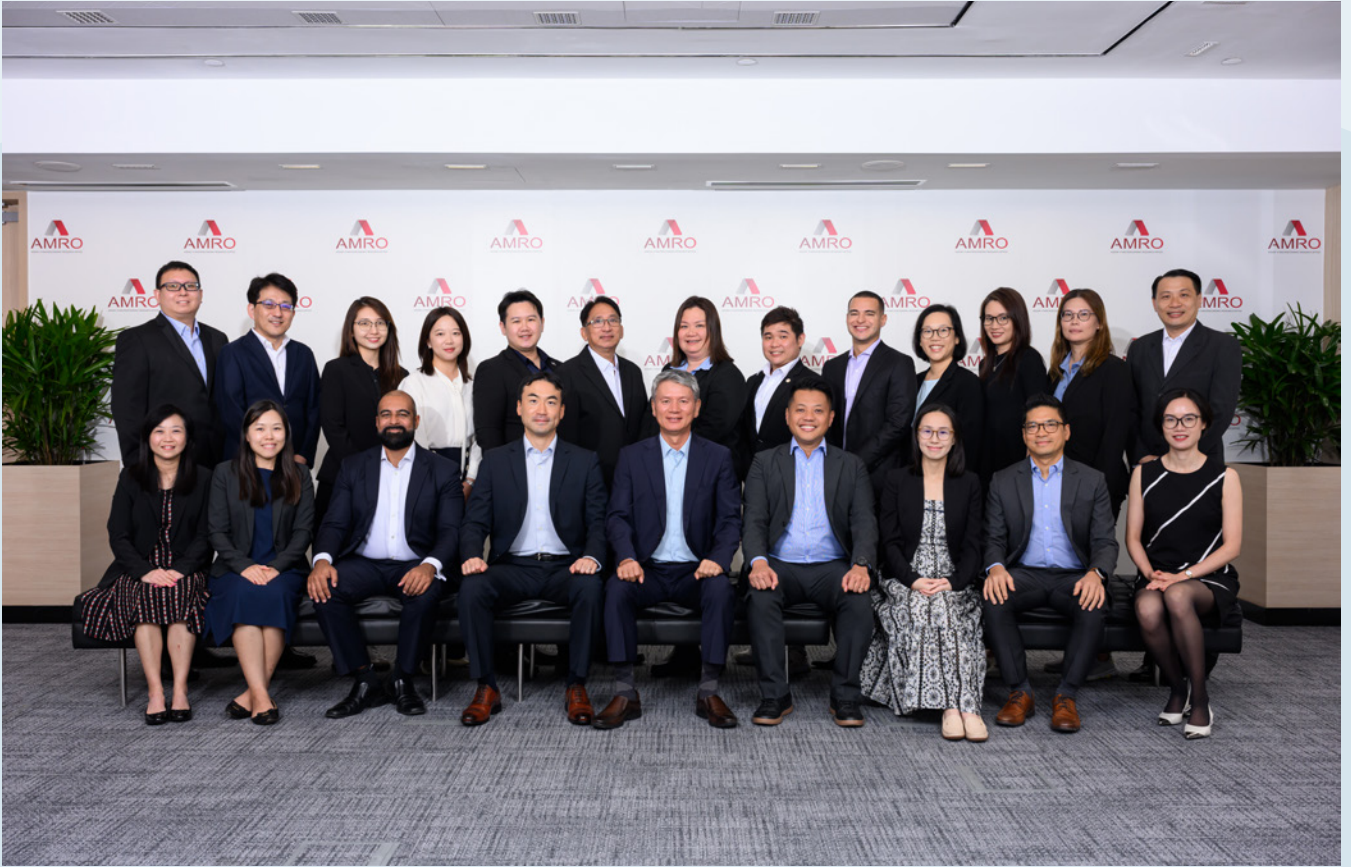
AMRO Budget, HR and Support Service Group; Legal Team; and Technical Assistance Team