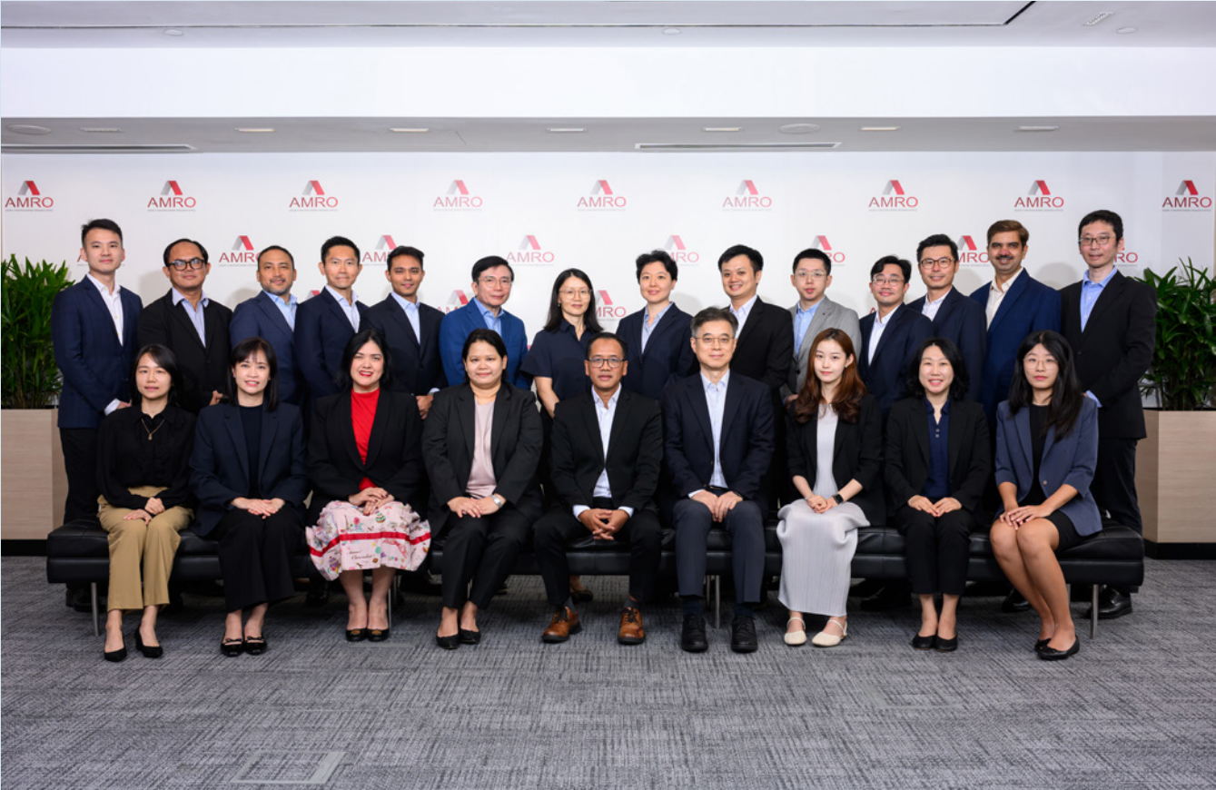
AMRO Financial Surveillance, Fiscal Surveillance, and Macro-Financial Research Groups