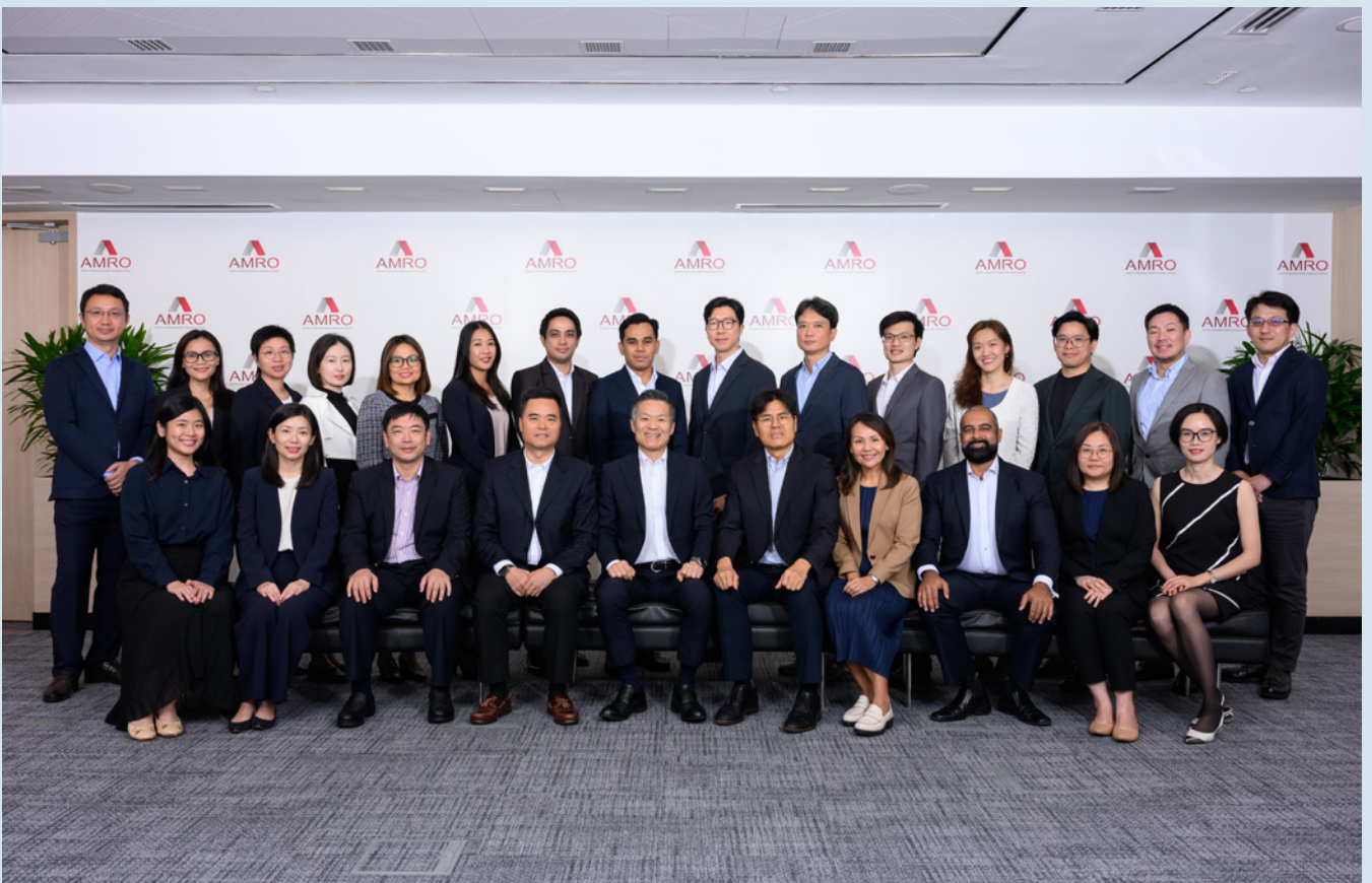
AMRO CMIM Support Group; Strategy and Coordination Group; Policy and Review Group; and Technical Assistance Team