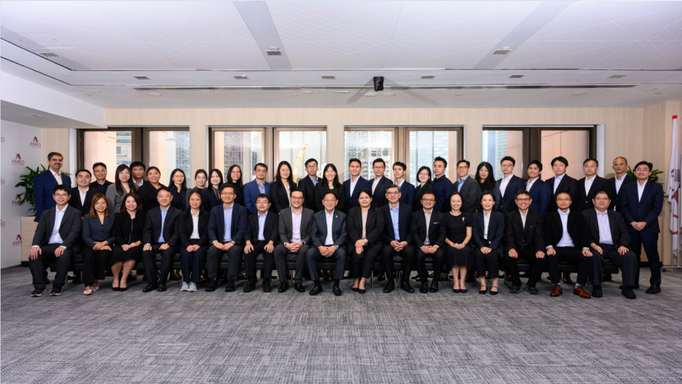
AMRO Country and Regional Surveillance Groups