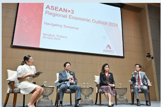
AREO roadshow in Thailand