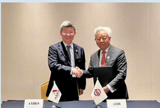
Signing of MOU with AIIB

To deepen ties and pave the way for more sustained collaborative initiatives, AMRO inked several new MOUs with key partners. The MOUs with the AIIB , SUFE , and the AFDI reinforced the shared commitment to fostering regional macroeconomic resilience and financial stability through knowledge sharing and capacity development.